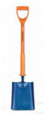
Insulated Square Mouth