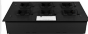
Multi Charging Bay