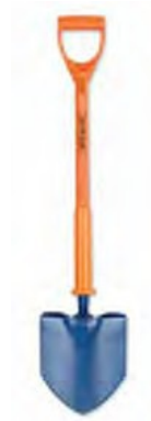
Insulated Round Mouth